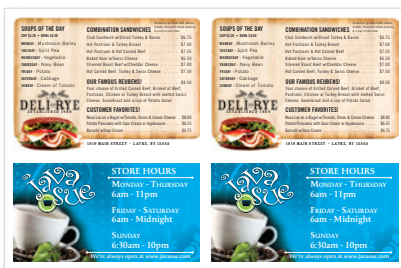
Image quality, ease of use, productivity, media latitude, feeding and finishing options, plus world-class workflow solutions are at your fingertips. Grow your digital colour printing capabilities and reduce costs with the Xerox® Colour 560/570 Printer.