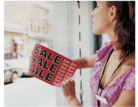
Xerox® NeverTear Window Signs

With our special polyester EA Low Melt Toner, the output fuses to polyester in a chemically bonding way, ensuring outstanding image quality on specialty substrates such as polyester and more – allowing you to offer a broader set of media choices. Premium NeverTear is water, oil, grease and tear resistant.