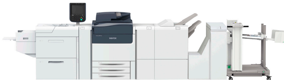
The Plockmatic MPS XL inline with the Xerox® Versant® 280 Press