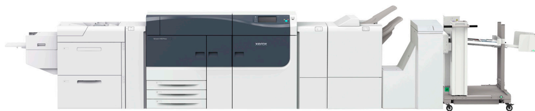
The Plockmatic MPS XL inline with the Xerox® Versant® 4100 Press