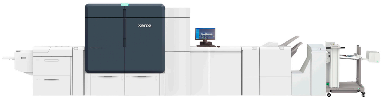
The Plockmatic MPS XL inline with the Xerox® Iridesse® Production Press