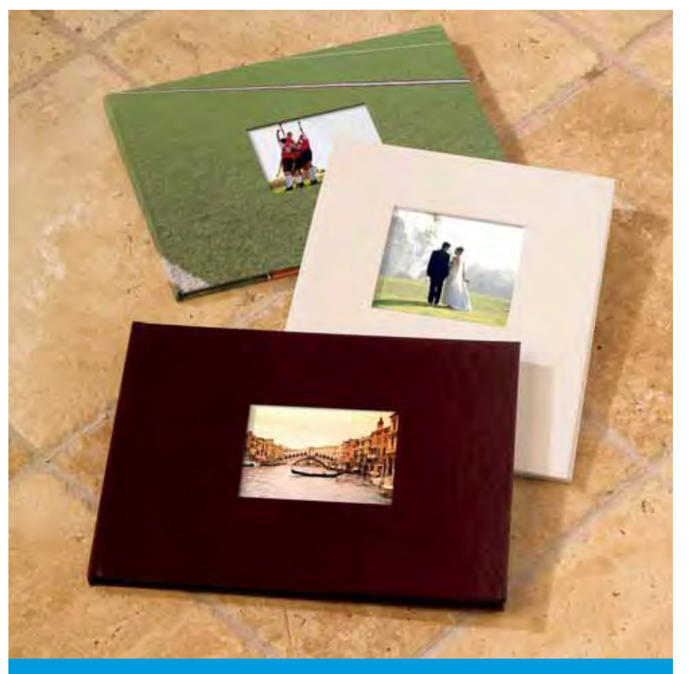
Photo Optimized Settings—The major film processors have conditioned us to appreciate certain photographic attributes—such as greener grass, brighter colors and warmer flesh tones. The iGen4's FreeFlow® Print Server has several settings to optimize photos, resulting in better color balance, warming up the image to give it a more "photographic look" that many have become accustomed to.

In their comparative analysis, SpencerLab had this to say about the 4-color iGen4 Press as compared to our leading competition: "The Xerox iGen4 offered the overall best photographic image quality among the tested digital press solutions for photo book applications and is a competitive option to conventional photo processing."