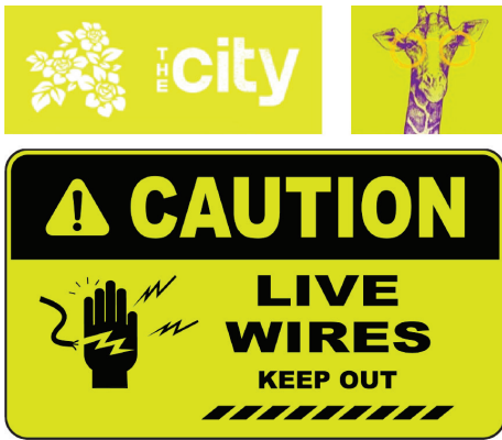
Spot and Flood Effects

When you need to dial up the value of your digital print jobs, iGen® 5 delivers. Designers can create files to run Fluorescent Yellow over or next to CMYK, amplifying page content and making critical messages stand out — loud and proud.