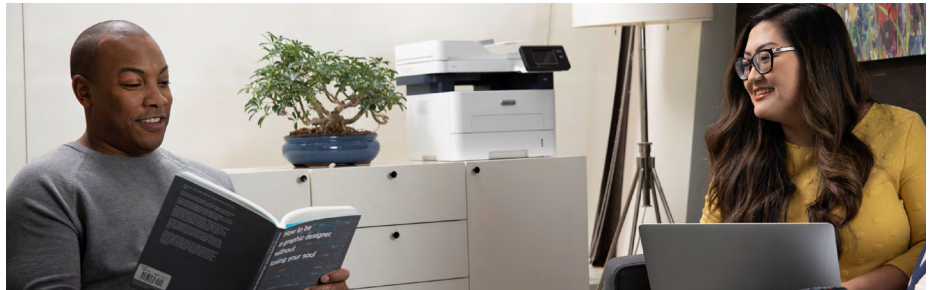
Choose your ideal home office assistant from a range of easy-to-use, reliable products that offer the functionality you need.

Visit the Xerox App Gallery to see how you can transform the way you handle documents and data.