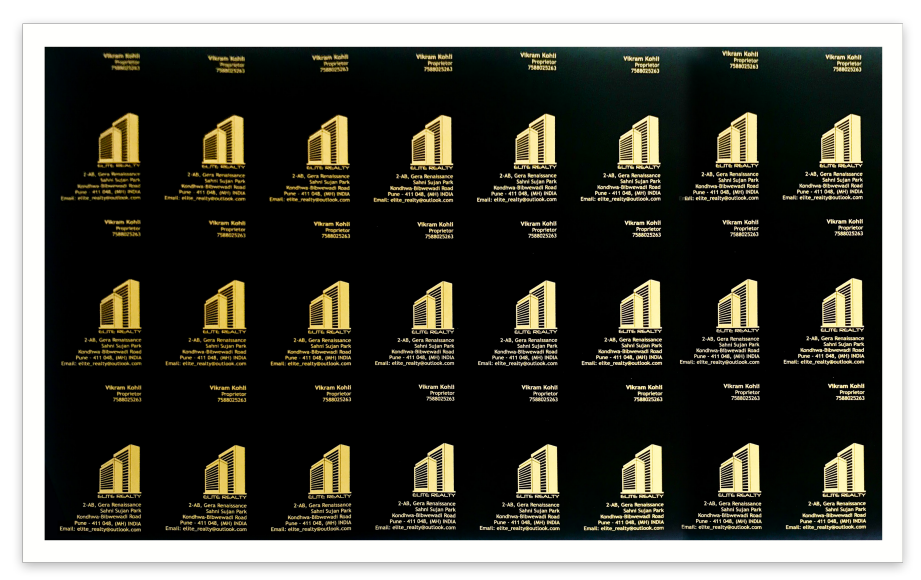
A sheet of ganged business cards printed with metallic gold dry ink