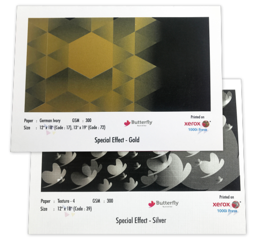
The New Point Cards and Printers sample album features examples of metallic gold and silver.