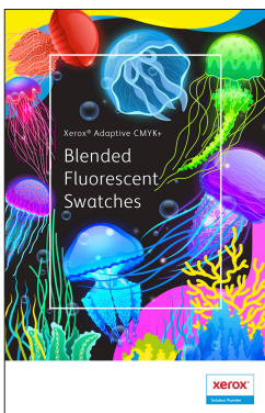
Title: Jellyfish background. Cartoon colorful transparent glowing underwater creatures floating together. Vector colorful poison sea jellyfish animals wallpaper Image #: 1424182345

If you want to modify the swatch book in any way aside from adding your logo , you must purchase rights to all the images used. The images that require purchase are shown below: