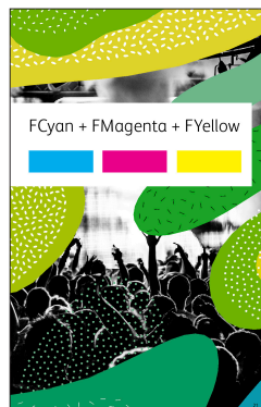
Title: Black and white DJ and crowd in nightclub Image #: 498731269