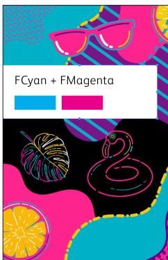
Title: Summer, layout design, greeting card, cover book, stripe line, colorful, template design, vector illustration Image #: 472160503