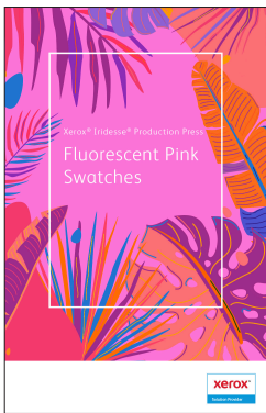
Title: Tropic summer pattern vector set with jungle exotic leaves in simple minimal flat style. Abstract tropical cover design Image #: 1391264622

If you want to modify the swatch book in any way aside from adding your logo , you must purchase rights to all the images used. The images that require purchase are shown below: