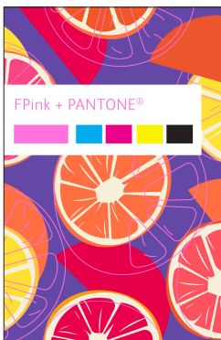
Title: Grapefruit pattern Image #: 1392735959