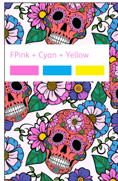
Title: Sugar skulls in pink tone with floral pattern seamless vector pattern Image #: 1521407261