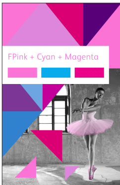
Title: Graceful ballerina dancing Image #: 182058322