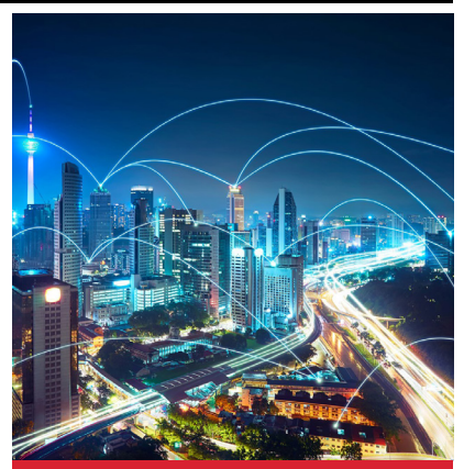
Focusing on data processing, document management, and print technologies to best serve a distributed workforce and hybrid work practices