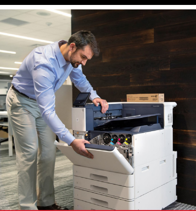
Reducing the impact during the consumption stage of our product lifecycle