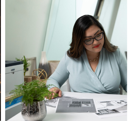
Helping clients design and maintain a more sustainable workplace with a developing portfolio of solutions