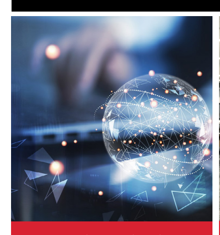
Accelerating digital transformation